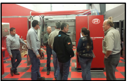
JFM Dairy and Nutrition Teams talk robots at the Lely Training Centre in Woodstock.

As we are all aware, in the sales industry, making the sale is only part of the process. In today's world, supporting that sale becomes an even greater responsibility than the sale itself. At JFM, training and exposing our sales and nutrition teams to new ideas, processes, people and products is an on-going practice. It is through this approach that new ideas emerge and we are able to suggest and provide solutions that assist our customers in achieving their goals and ultimately becoming more profitable. Below are a few examples of some of the on-going training your Jones Teams have been involved in this summer.